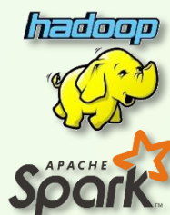
Big Data Platforms for Scale

About Data Science: Data Science is an inter-disciplinary field that uses mathematical, algorithmic & distributed systems techniques to extract useful knowledge and insights from massive quantities of data. Such complex analysis can help search through knowledge graphs, manage traffic using video analytics, or improve our understanding of the human brain. Scalability is a key facet of data science.